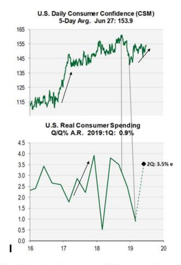
"A Volatile but Healthy Consumer", Cornerstone Macro 7/1/195

effects, such as alleviating the headwinds of the tightening of consumer lending standards.<sup>5</sup> We're also currently giving the average consumer a clean bill of financial health: low interest payments, low debt, and a high savings rate.